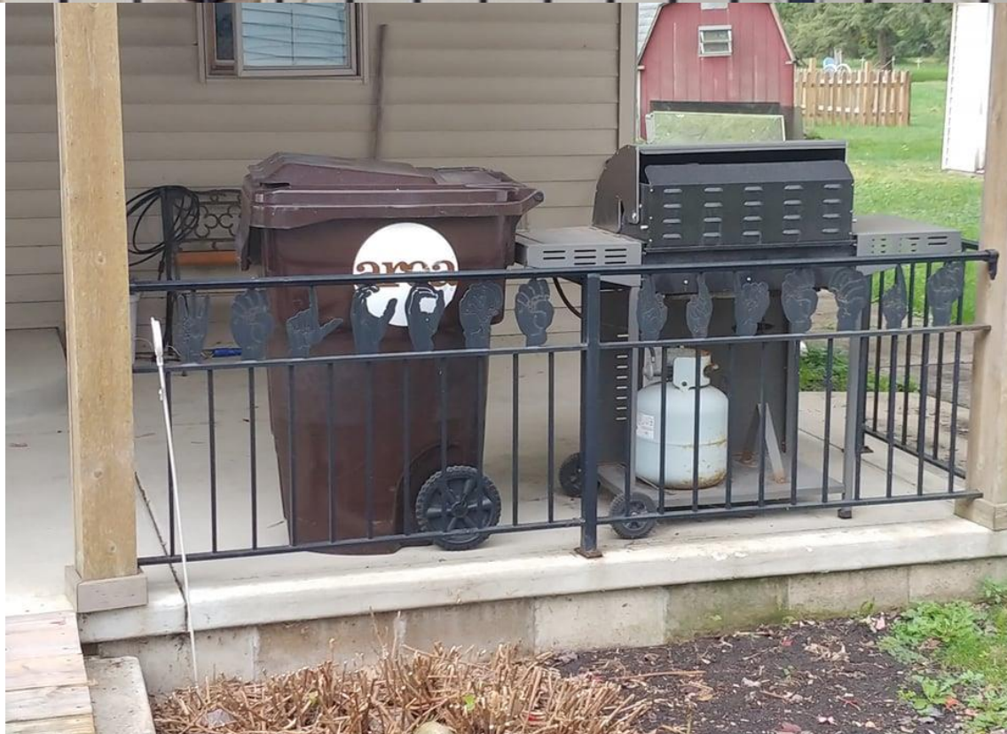
Welcome Friends in Sign Language at Steve Howe's house in Brimfield, IL