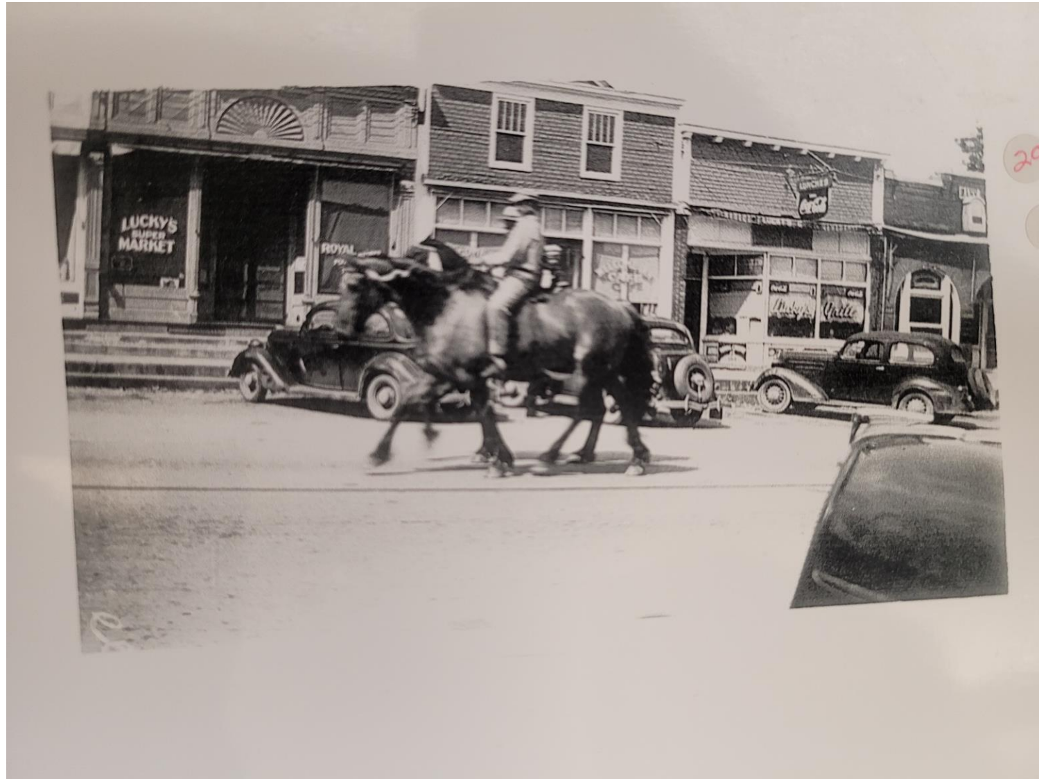
Old Settler's Parade – 1945; Lucksy's Grill in background on right.