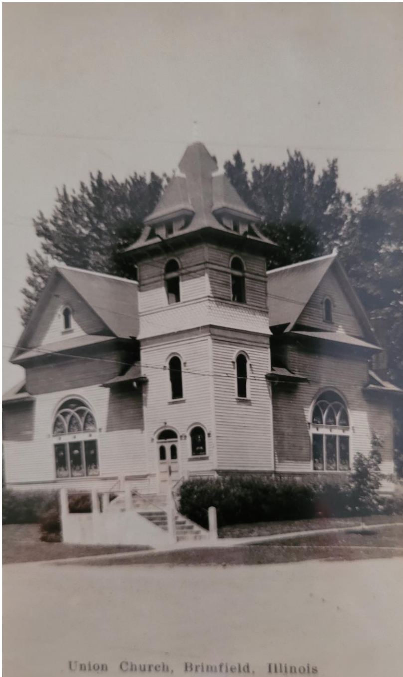
Union Church Brimfield, Illinois