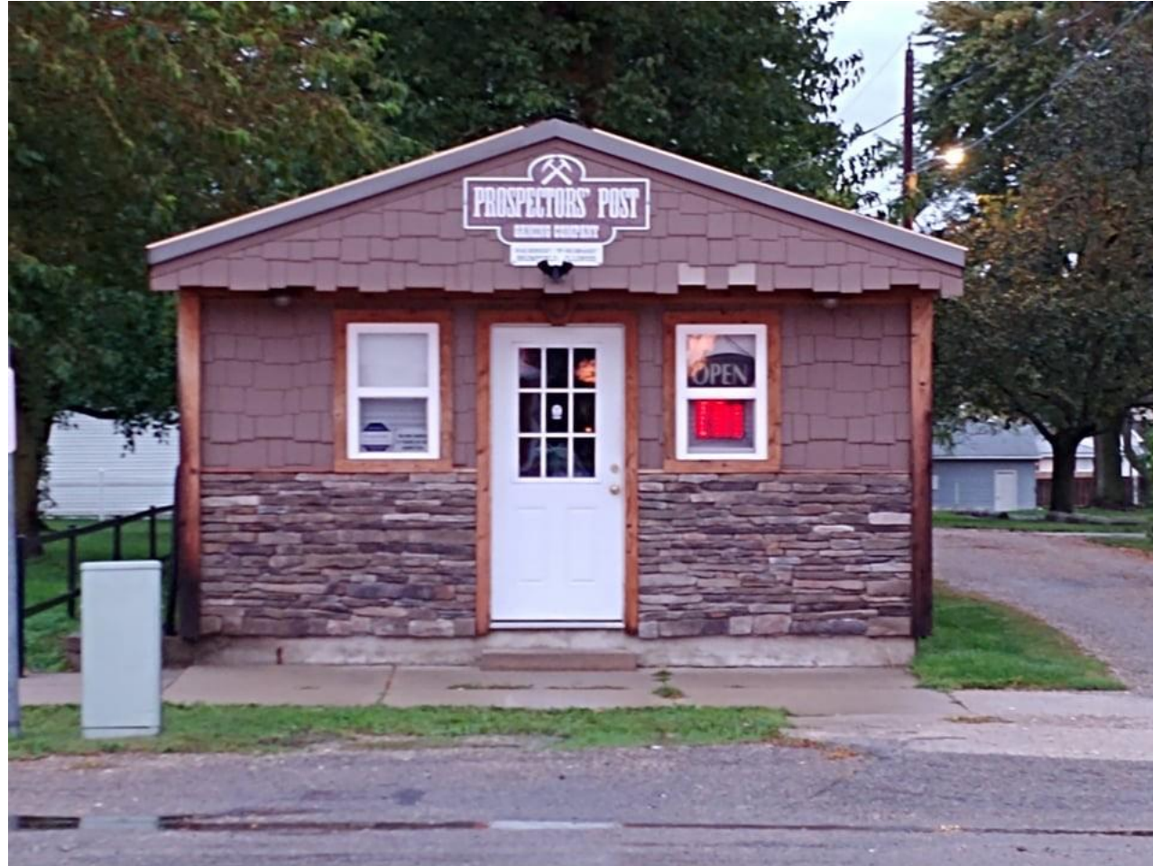
Prospector's Post (Galena Avenue, Brimfield, Illinois)