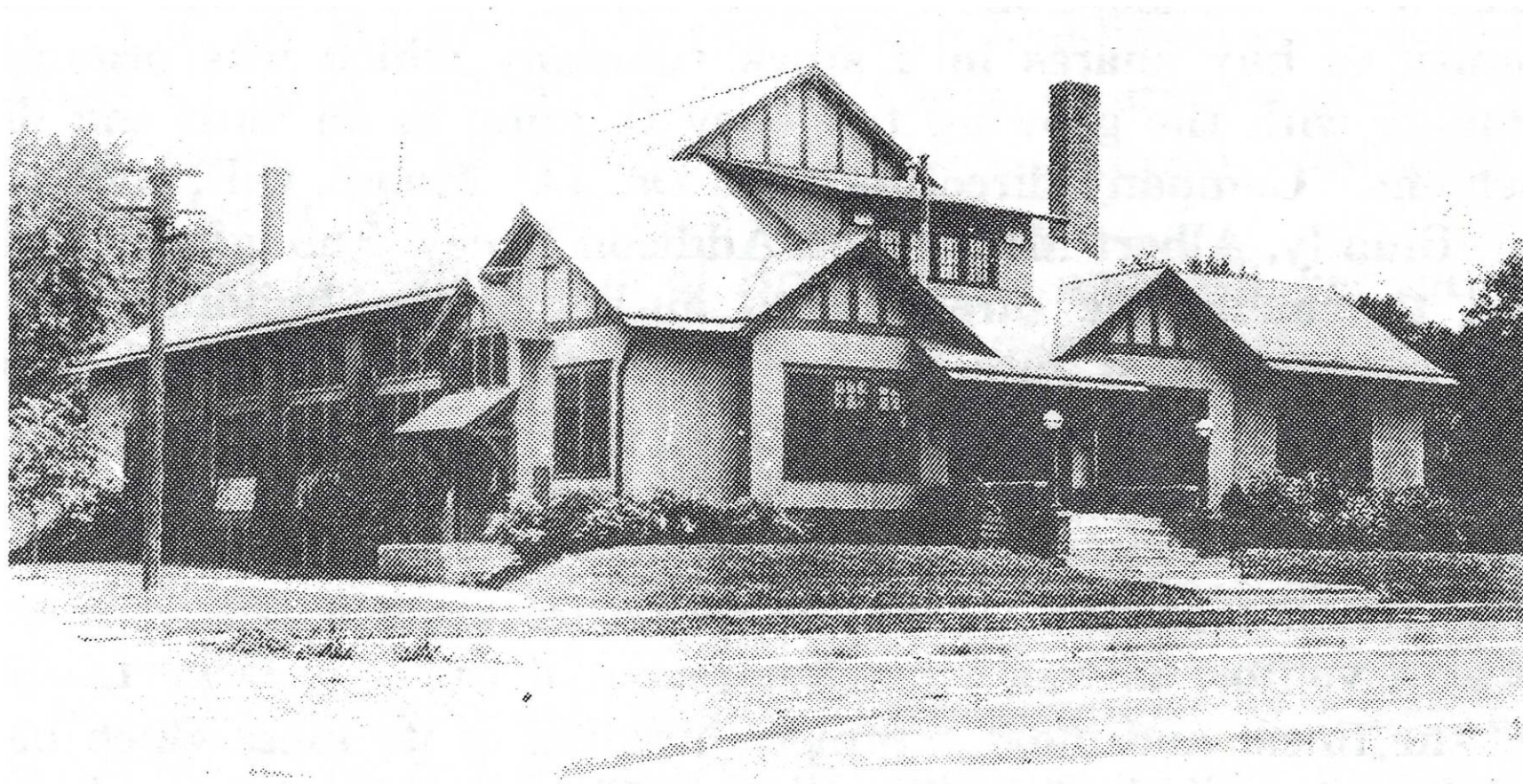
COMMUNITY BUILDING (1918-1977)