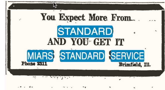
Miars Standard Service advertisement, Brimfield News (Illinois), 11 May 1961, p. 1, cols. 6–7; digital image, Digital Archives of the Brimfield Public Library ( http://brimfield.advantage-preservation.com/ : accessed 11 Oct 2021).