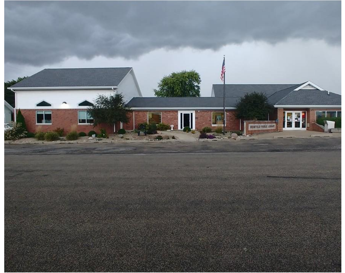
Brimfield Public Library (111 South Galena Avenue, Brimfield, Illinois)