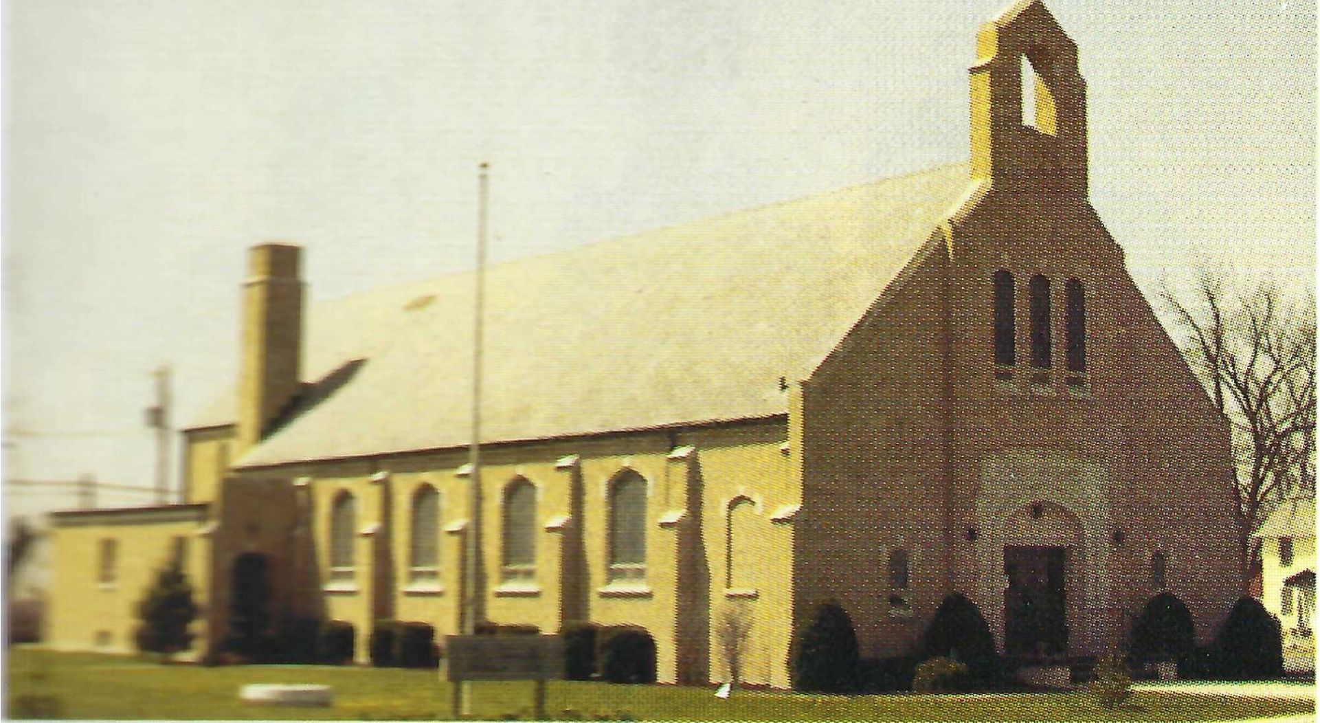
St. Joseph's Parish, Brimfield