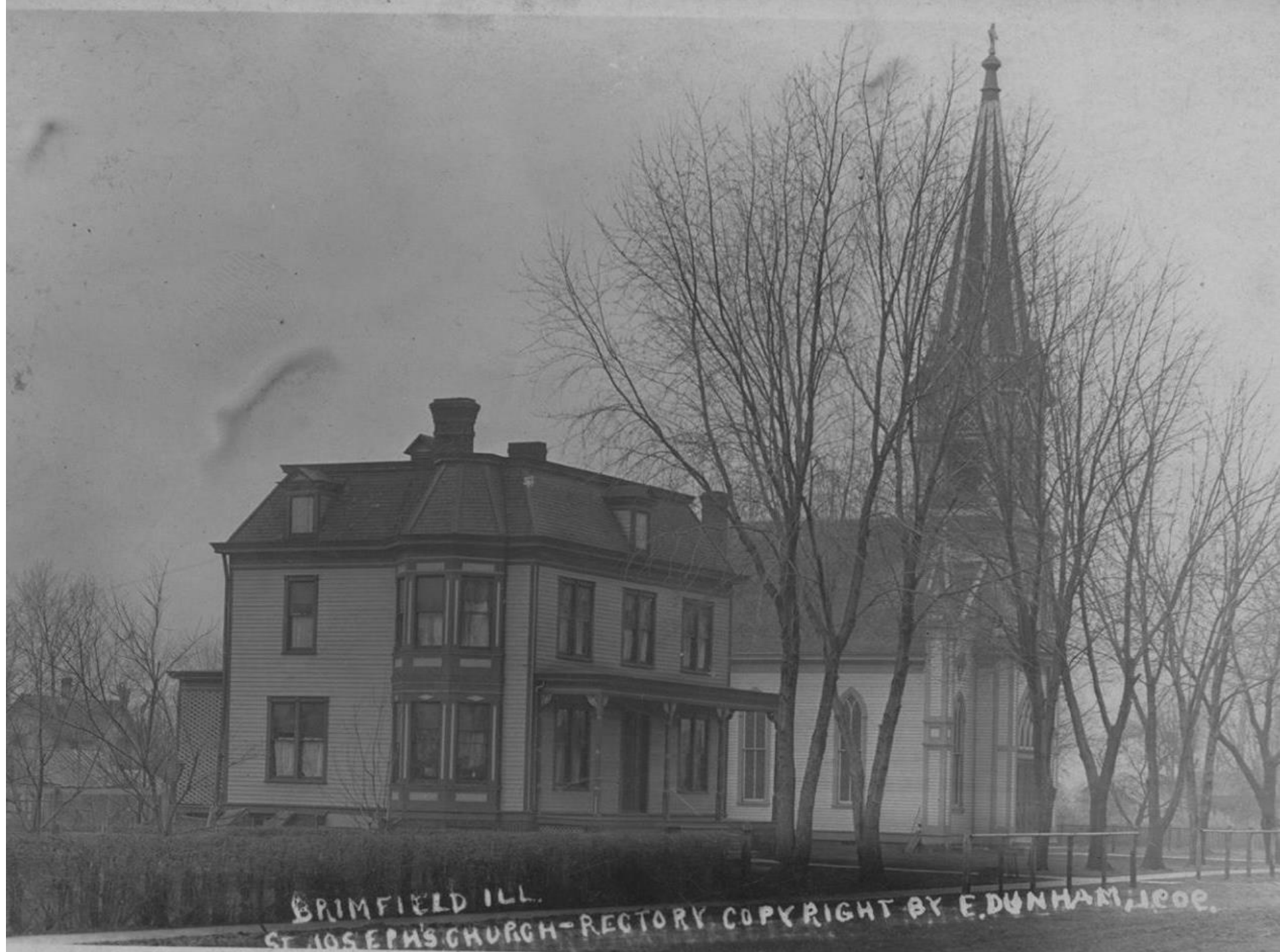
BRIMFIELD ILL. ST. JOSEPH'S CHURCH-RECTORY.