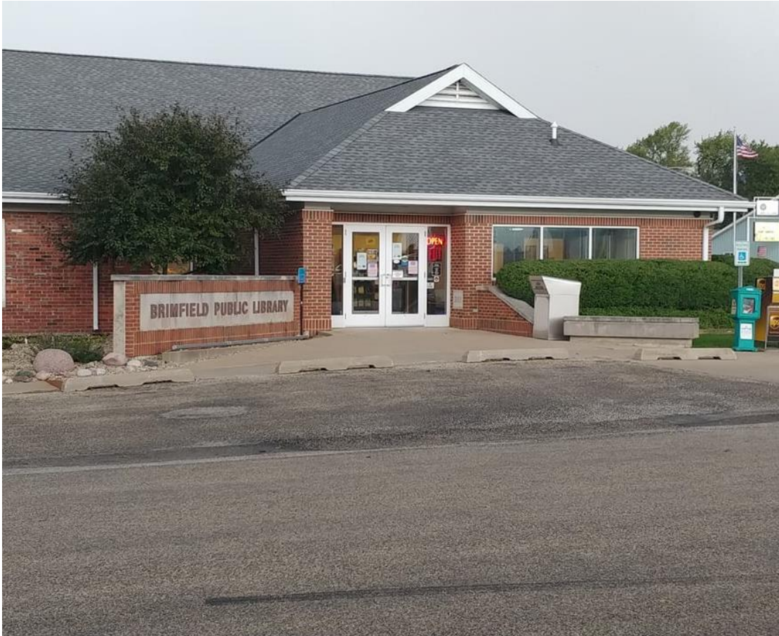
Brimfield Public Library (111 South Galena Avenue, Brimfield, Illinois)