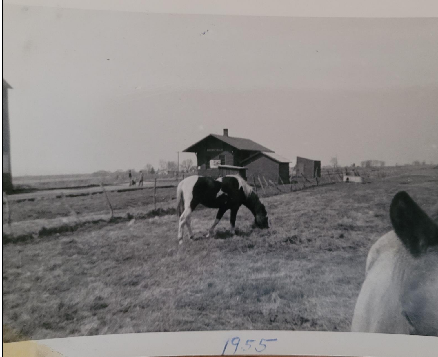
Red White rented pasture for horses & cows. Note the old train depot in photo, on the north end of town