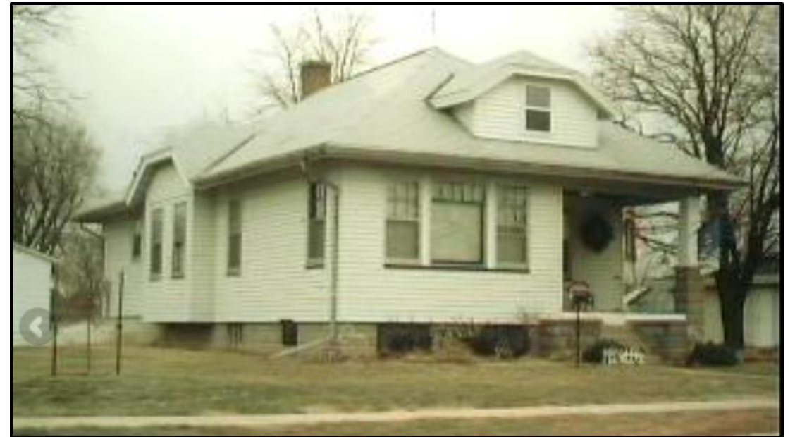
Photo top right courtesy of Brimfield Historical Society, bottom right Peoria County GIS, top left from Small Houses of the Twenties 1991 by Dover Publications, page 64