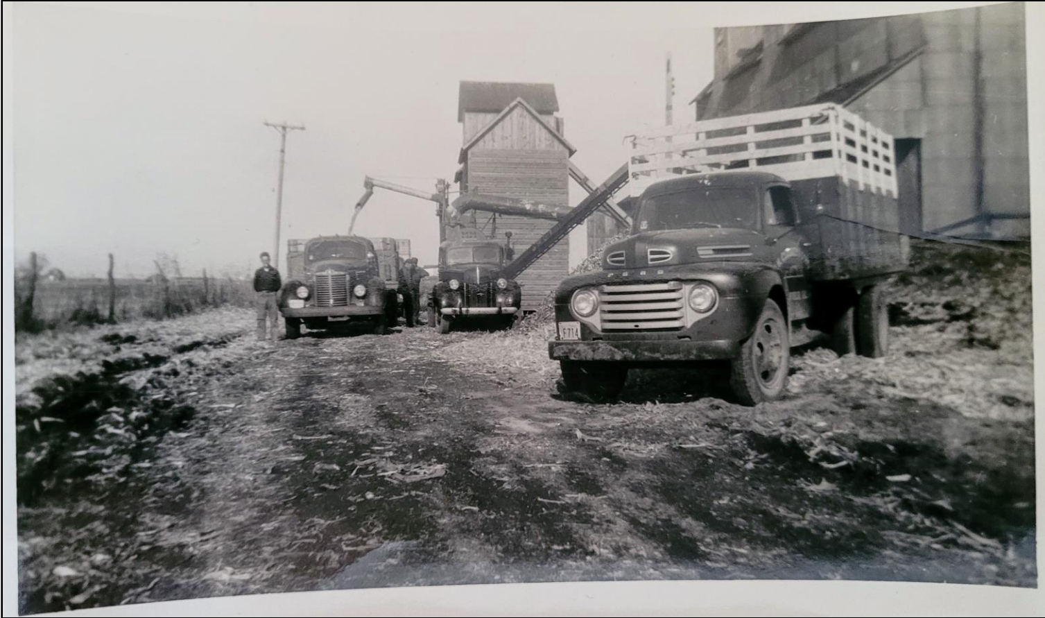
Red White and Donnie Summerson (eldest grandson).