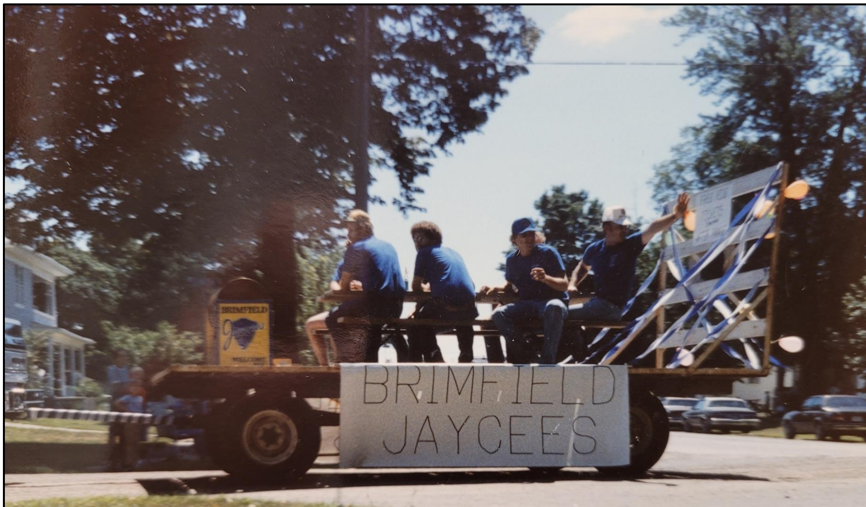
Old Settlers Parade, Brimfield Jaycees