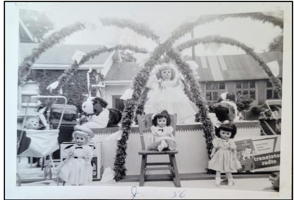
Memler's Float in 1956 Old Settlers Parade