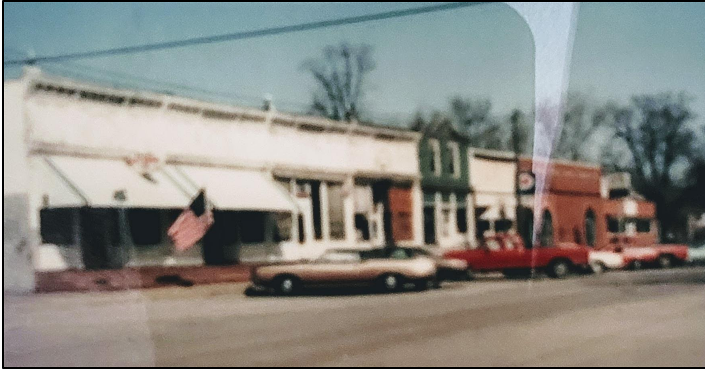
Memler's Store north east side of Rt 150 businesses.